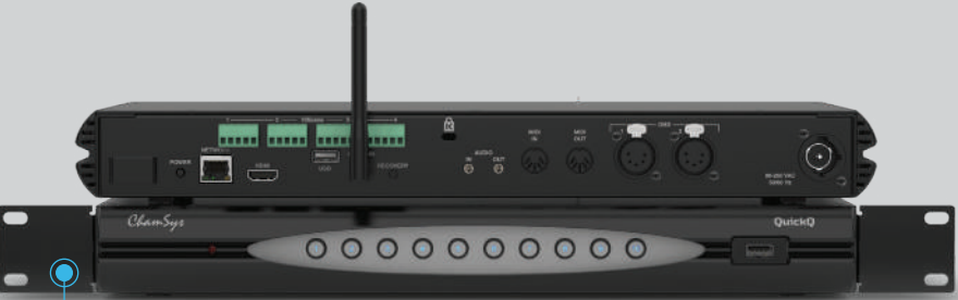
Shown with included rack ears.