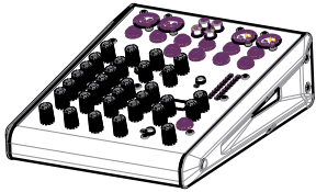
VISTA 3D / 3D VIEW