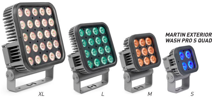
THE COMPLETE MARTIN EXTERIOR WASH PRO QUAD LINE