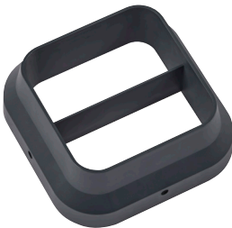
BAFFLE SNOOT PRO S QUAD