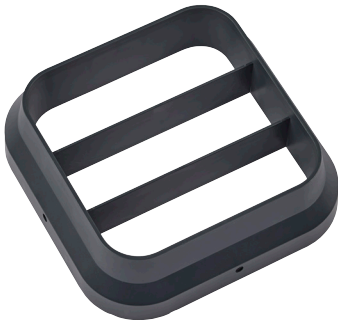
BAFFLE SNOOT PRO M QUAD