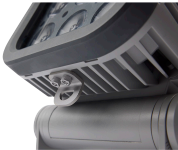
ATTACHMENT PLATE FOR SAFETY WIRE INSTALLED