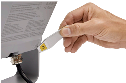
EXTERIOR WASH PRO MULTI-TOOL