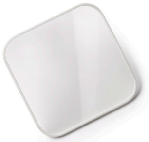
EXTERIOR WASH PRO MICRO LENS