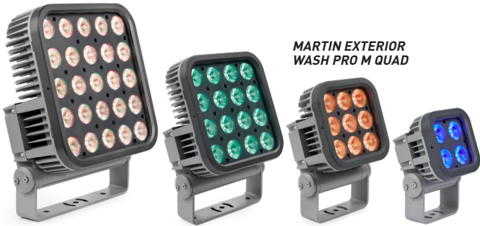
MARTIN EXTERIOR WASH PRO M QUAD