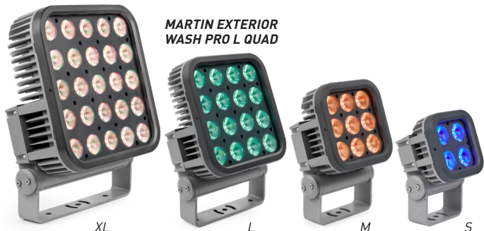
THE COMPLETE MARTIN EXTERIOR WASH PRO QUAD LINE