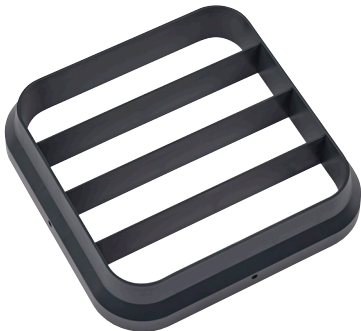
BAFFLE SNOOT PRO L QUAD